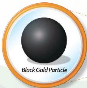
Differentiated Black Gold Conjugate Technology